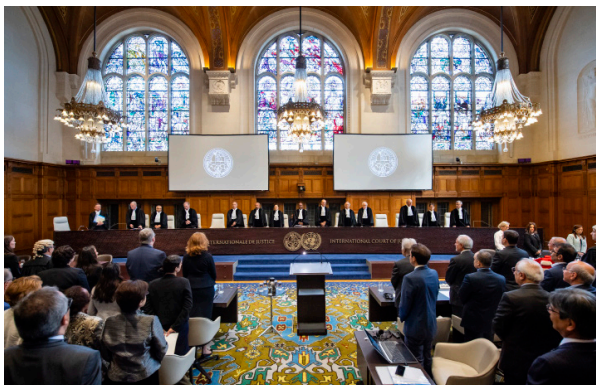
International Court of Justice