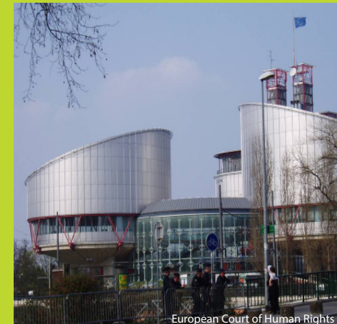
European Court of Human Rights