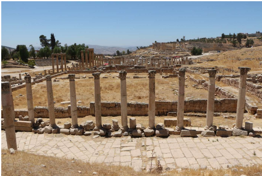
Mosque and Temple of Zeus Olympios in Jerash

The Roman colony of Aquileia represents an excellent case-study for comparing the effectiveness of Roman and Late antique rubbish management, therefore allowing for an appraisal of the city's state of health during the period.