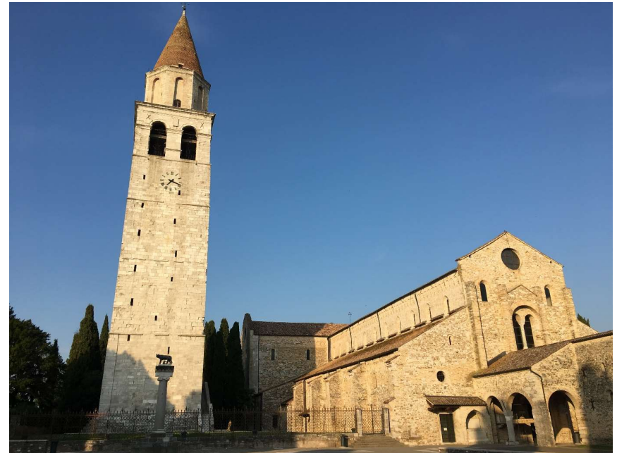
Patriarchal Basilica of Aquileia