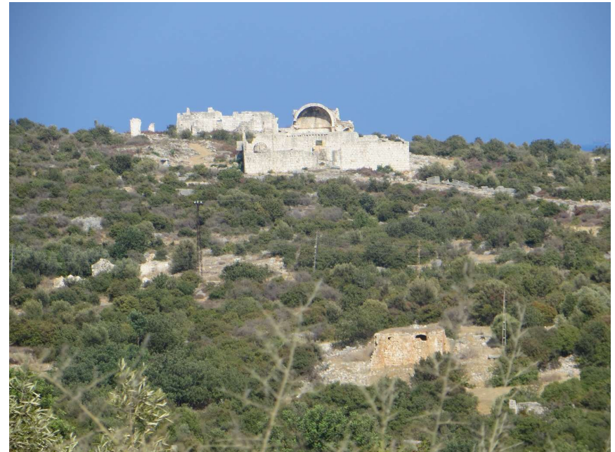
The Grave Church extra muros and the Transept Church in Korykos (Cilicia)