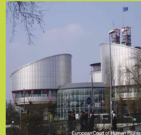
European Court of Human Rights