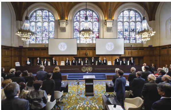
International Court of Justice